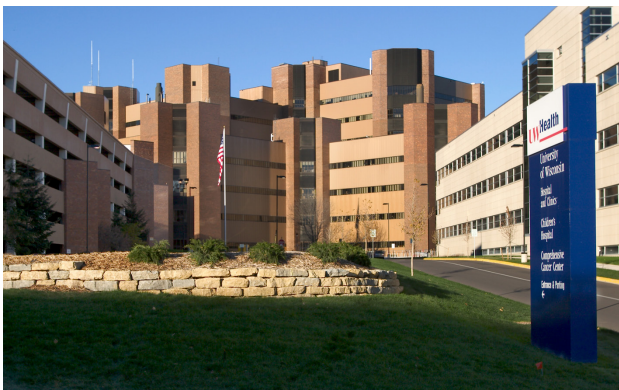
University Hospital will host on-site, hands-on workshops on Saturday, July 14, the second day of the 15th Biennial Phonosurgery Symposium.