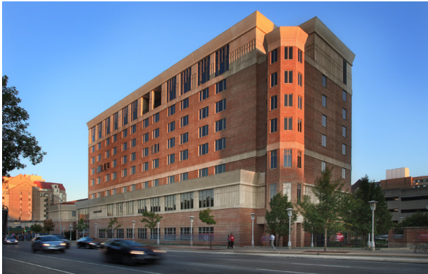
The Fluno Center, on the University of Wisconsin-Madison campus, will host Upper Airway Microbiome and the 15th Biennial Phonosurgery Symposium.

PLEASE NOTE: Educational credits are available for the Phonosurgery Symposium events on July 13-14. Credits are not available for the Upper Airway Microbiome conference event on July 12.